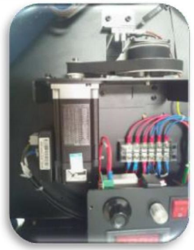
Leadshine Brushless motor