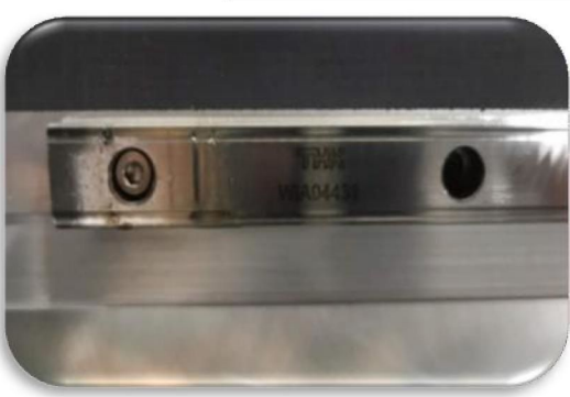
THK Linear rail